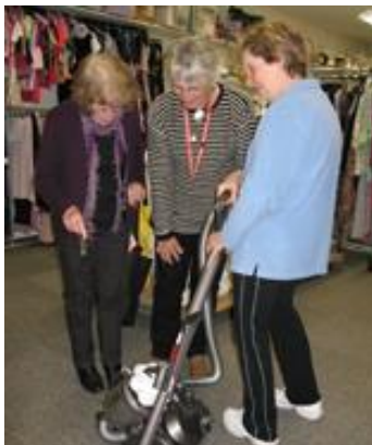
Volunteers at the Goulburn Red Cross retail shop with their new equipment

The Veolia Mulwaree Trust provided grants and donations to 81 community groups and organisations in 2011/2012 valued at more than $600,000