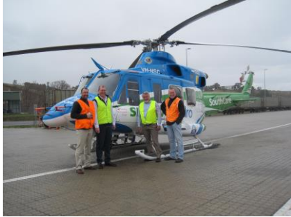
Support for the Snowy Hydro SouthCare aero-medical and rescue helicopter service within the ACT and Southern NSW region