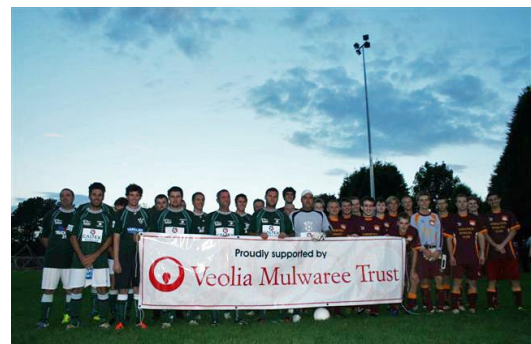
Members of the Robertson Burrawang Rovers Soccer Club celebrate the Hampden Park Field Lighting Upgrade Project