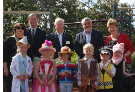
Opening of the Burrawang Public School new playground equipment